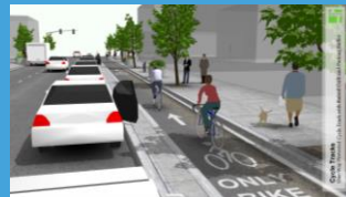
Travel Side Buffer