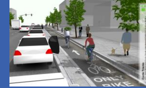
One Way, Raised Curb