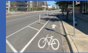
Ft. Worth Ave.