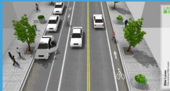
Conventional Bike Lane