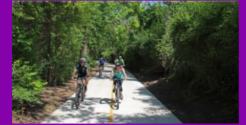
Great Trinity Forest Trail