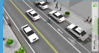
Conventional Bike Lane