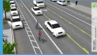
Parking Side Buffer