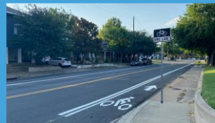
N. Polk St.