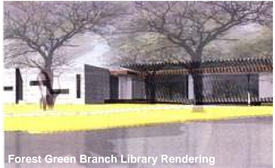
Forest Green Branch Library Rendering